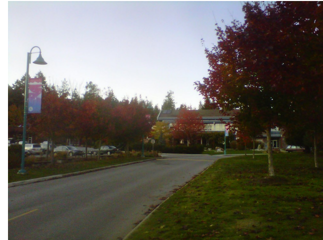
Red Maple Trees ( Acer rubrum ) along Rosina Giles Way