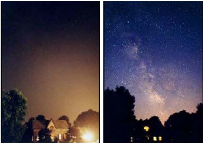
Typical lighting (on left) compared to dark sky approach (on right)