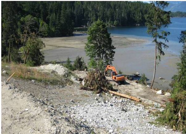
✘ Clearing adjacent to the shoreline should be avoided and upland vegetation retained.