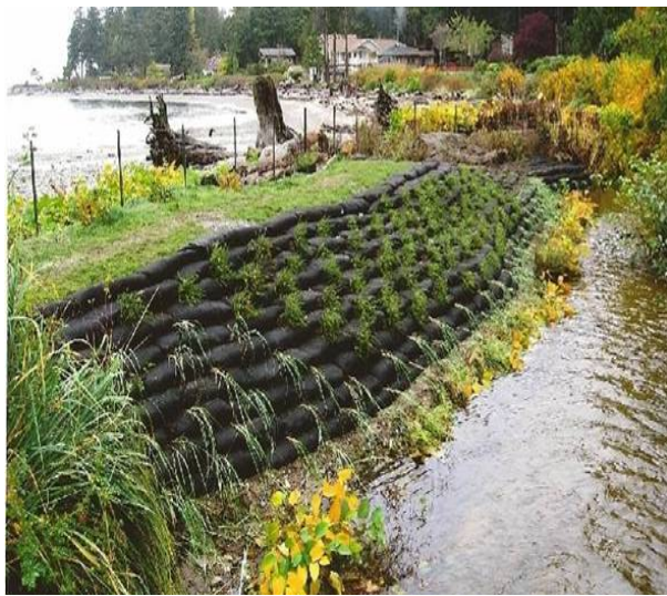
✔ Soft shoreline protection approaches can restore habitat values as well as protect upland property from wave action and erosion (Roberts Creek)